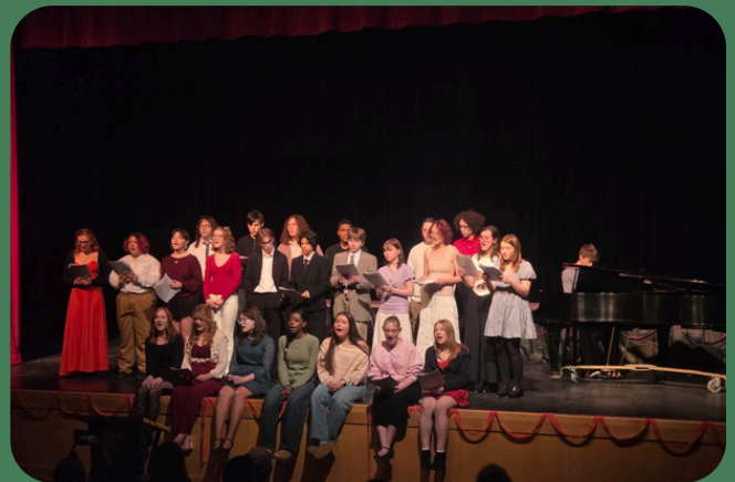
A LOVELY NIGHT OF THEATRE

THE SECOND PARK PLAYERS CABARET, A LOVELY NIGHT OF THEATRE , WENT OFF WITHOUT A HITCH. THE STUDENT ACTS RANGED FROM PERFORMANCES FROM WICKED , TO A RECREATION OF THE BALCONY SCENE FROM ROMEO AND JULIET . IT WAS FINISHED OFF WITH THE ENCORE OF "SEASONS OF LOVE" FROM RENT , STARRING THE ENTIRE PERFORMING ENSEMBLE. WITH THE DONATIONS FROM THE AUDIENCE, AND THE ADDED GIFT BASKET AND SEASON TICKET RAFFLE, WE MANAGED TO RAISE A COMBINED TOTAL OF OVER $375 FOR OUR PROGRAM. THIS MAKES OUR LOVE-THEMED FEBRUARY CABARET A RESOUNDING SUCCESS, LEAVING OUR STUDENT PERFORMERS EAGER FOR A POSSIBILITY TO DO IT LATER THIS SCHOOL YEAR. THANK YOU TO EVERYONE WHO PERFORMED AND ATTENDED!